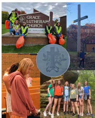
Confirmation students actively involved with Grace programs.

We challenge all of Graces' members to use their hands, to do God's work. “God's work. Our Hands.”