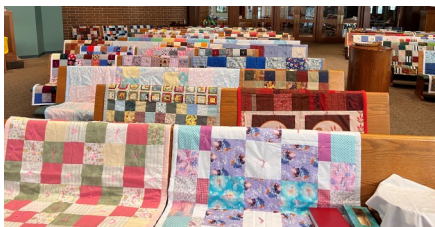
Some of the quilts Grace's Sewing Circle distributed in November.

We distributed twice this year, in April and again in November, with our 2025 year-end stats being the following: Locally distributed items were 272 lap quilts, 94 crocheted blankets, 102 small pillows, 67 neck pillows, 508 walker bags, 180 wheelie bags, 178 cell phone bags