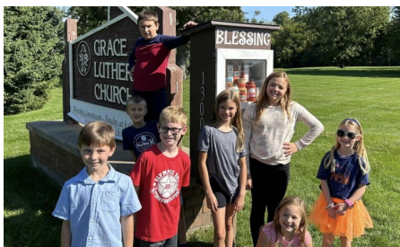
On Oct. 1, Sunday School children filled the Blessing Box with items purchased at Aldi.

Confirmation meets Nov. 1, 8, 15 & 29 this month. However, there will be no class on Nov. 22 as Community Unit School District 200 is closed Nov. 22 – 24.