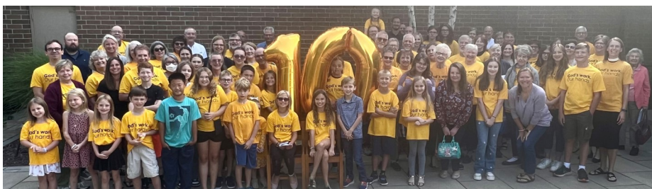
Participants in the Sept. 10 ELCA 10th annual "God's work. Our hands." Thank you to all who participated in this Day of Service.

and blessing for ministry. Then, volunteers gathered into teams for a variety of service