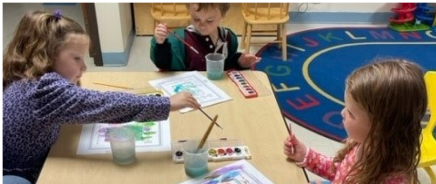
The PreK-K Sunday School class used watercolors to bring Bible stories to life on Sept. 17.

GRACE FOR TODAY —The deadline for the November 2023 newsletter is October 15 . Please send articles to Kari Gippert at kgippert@gracewoodstock.org , or the church office. Questions: Call the office at 815-338-0554 .