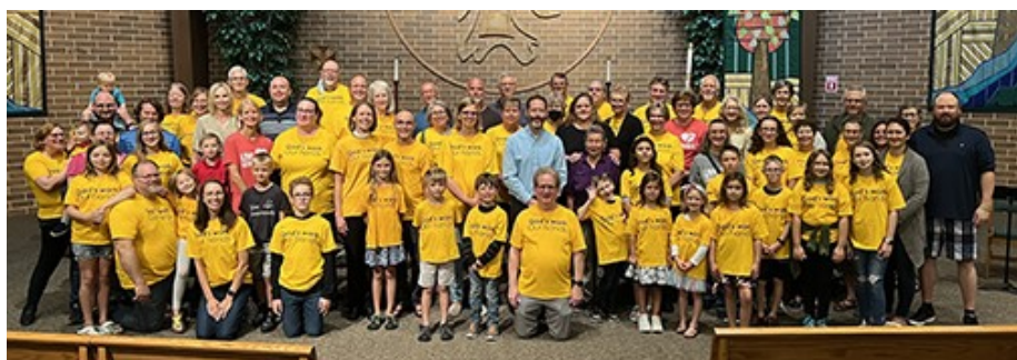
Grace Lutheran participants in the 2022 "God's Work. Our Hands." ELCA Service Project Day.

In August, play on Wednesday, Aug. 2 and Wednesday, Aug. 16 at 1 p.m. or at 6:30 p.m. on Tuesday, Aug. 8. Enter through the lower-level parking lot entrance.