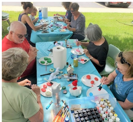
Kindness Project participants paint rocks last month.

Contact Sally Sheahan by phone call or text at 314-910-0541 for more information.